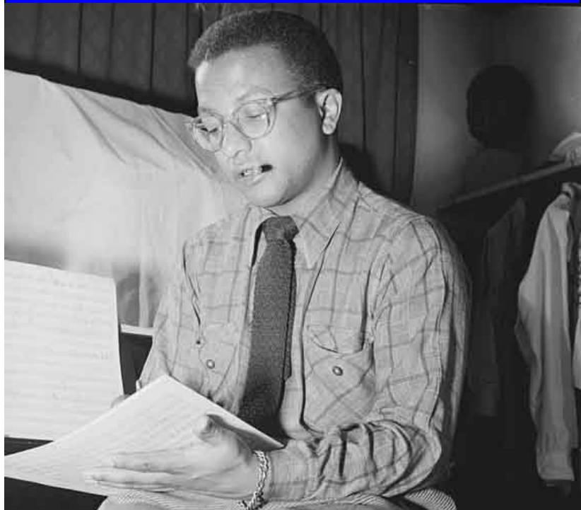
One of Pittsburgh's favorite sonos — composer Billy Strayhorn (1915-1967) is the subject of a special concert being held this month at the Cabaret at Theatre Square.

Celebrate Pittsburgh's arts & entertainment