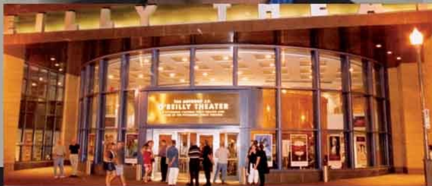
Michael Graves (1934 - 2015)