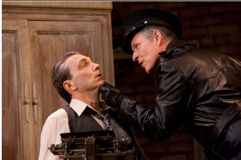
Quantum Theatre is staging a local production of the award winning play “Collaborators” at a location near Bakery Square.

Celebrate Pittsburgh's arts & entertainment history and community.