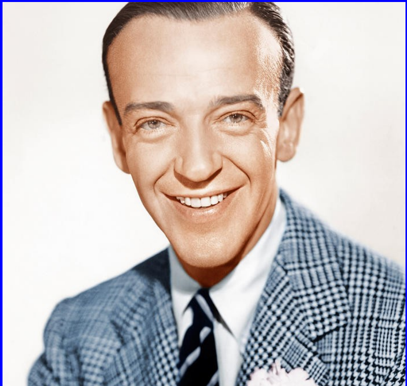
Fred Astaire shines in the 1951 film "Royal Wedding," which gets a special trivia-filled showing for Valentine's Day on Channel Pittsburgh.