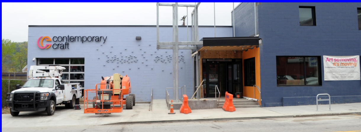
A sign of reopening: Contemporary Craft shared this image taken May 14 of construction resuming at their new facility in Upper Lawrenceville.